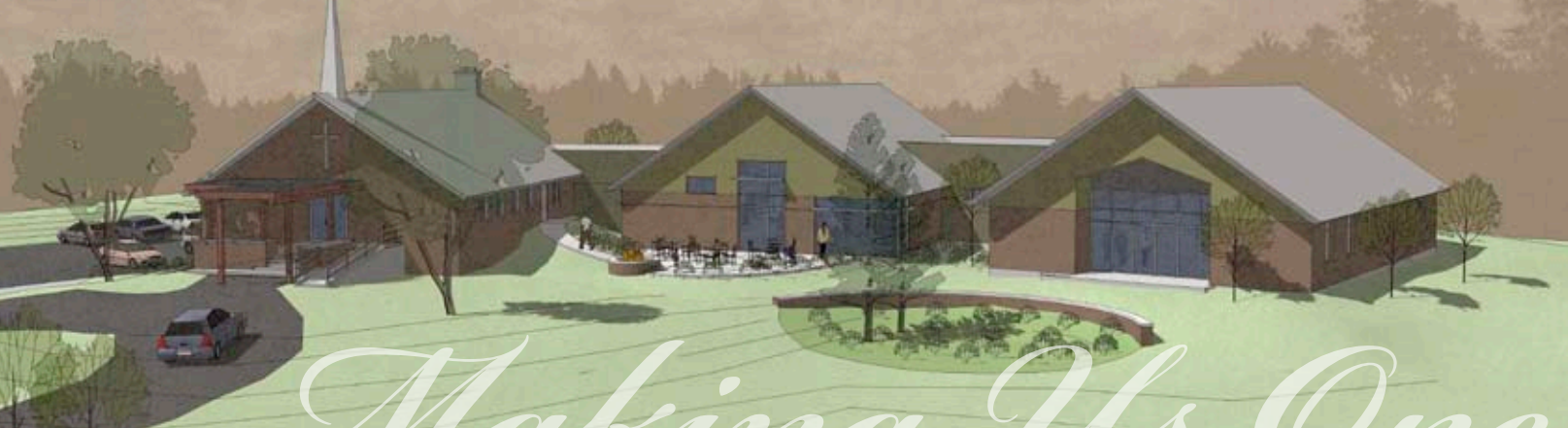
CAMPUS VIEW FROM THE SOUTH