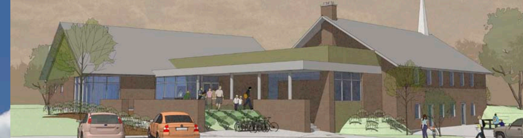
CAMPUS VIEW FROM THE NORTHWEST

North/West Lower Michigan Synod ELCA 801 S. Waverly Road, Suite 201 Lansing, MI 48917